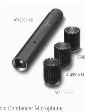
AT4053b Hypercardioid Condenser Microphone