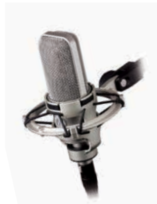
AT4047/SV Cardioid Condenser Microphone