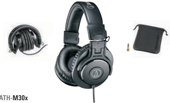
ATH-M30x Professional Monitor Headphones

frequency response: 15–24,000Hz included accessories: 1.2m-3m coiled cable, 3m straight cable, 6.3mm (1/4") adapter, protective pouch.