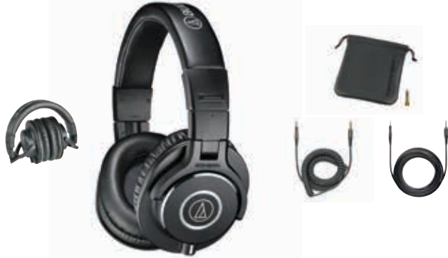
ATH-M40x Professional Monitor Headphones

The high-performance ATH-M40x professional headphones are tuned flat for incredibly accurate audio monitoring across an extended frequency range. Your studio experience is enhanced with superior sound isolation and swiveling earcups for convenient one-ear monitoring. Engineered with pro-grade materials and robust construction, the M40x excels in professional studio tracking and mixing, as well as DJ monitoring.