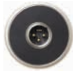
Bottom of Microphone