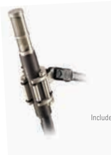
Included AT8481 Isolation Clamp