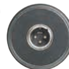
Bottom of Microphone