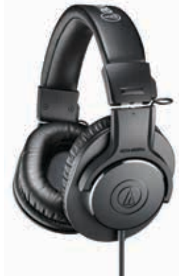
ATH-M20x Professional Monitor Headphones

The ATH-M20x professional monitor headphones are a great introduction to the critically acclaimed M-Series line. Modern design and high-quality materials combine to deliver a comfortable listening experience, with enhanced audio and effective isolation. An excellent choice for tracking and mixing.