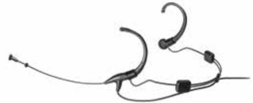
Optional AT8464 Dual-ear Microphone Mount

Also terminated for Audio-Technica and other manufacturers' wireless systems.