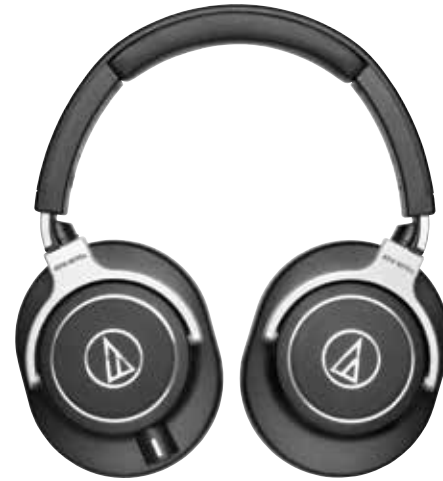
ATH-M70x Professional Monitor Headphones

The ATH-M70x professional monitor headphones are tuned to accurately reproduce extreme low and high frequencies while maintaining perfect balance. They are ideal for studio mixing and tracking, mastering and audio forensics. Crafted for lasting durability with a collapsible, space-saving design, the headphones provide excellent sound isolation and are equipped with 90° swiveling earcups for easy, one-ear monitoring.