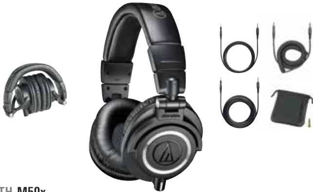
ATH-M50x Professional Monitor Headphones

This is the most critically acclaimed model in the M-Series line, praised by top audio engineers and pro audio reviewers year after year. The ATH-M50x features the same coveted sonic signature, now with the added feature of a detachable cable. From the large aperture drivers, sound isolating earcups and robust construction, the M50x provides an unmatched experience for the most critical audio professionals.