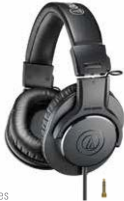
ATH-M20x Professional Monitor Headphones

The ATH-M20x professional monitor headphones are a great introduction to the critically acclaimed M-Series line. Modern design and high-quality materials combine to deliver a comfortable listening experience, with enhanced audio and effective isolation. An excellent choice for tracking and mixing.