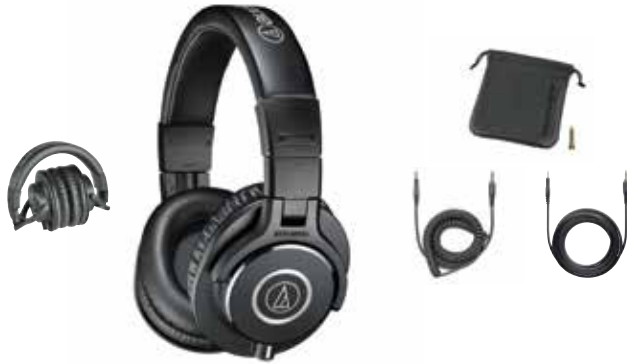
ATH-M40x Professional Monitor Headphones

The high-performance ATH-M40x professional headphones are tuned flat for incredibly accurate audio monitoring across an extended frequency range. Your studio experience is enhanced with superior sound isolation and swiveling earcups for convenient one-ear monitoring. Engineered with pro-grade materials and robust construction, the M40x excels in professional studio tracking and mixing, as well as DJ monitoring.