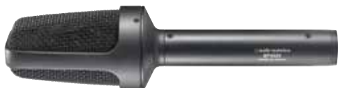
BP4025 X/Y Stereo Field Recording Microphone