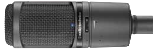
AT2020USBi USB Cardioid Condenser Microphone