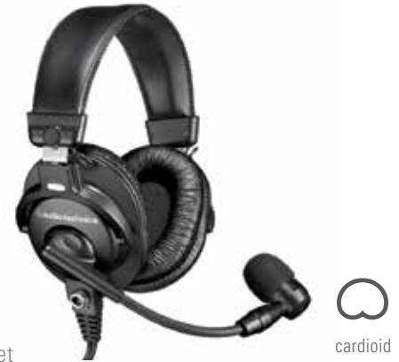
BPHS1 Broadcast Stereo Headset

frequency response: 15–20,000 Hz included accessories: 6.3 mm (1/4") adapter.