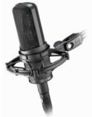
AT4050ST Stereo Condenser Microphone