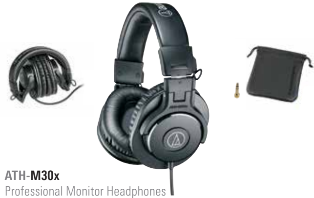
ATH-M30x Professional Monitor Headphones

frequency response: 15–24,000 Hz included accessories: 1.2 m-3 m coiled cable, 3 m straight cable, 6.3 mm (1/4") adapter, protective pouch.