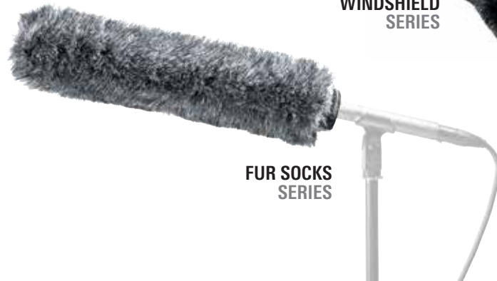
FUR SOCKS SERIES

Pull-on Fur Socks fit over an existing foam, windshield for enhanced windnoise protection.