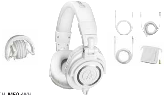
ATH-M50xWH Professional Monitor Headphones

frequency response: 15–28,000 Hz included accessories: 1.2 m-3 m coiled cable, 3 m straight cable, 1 m straight cable, 6.3 mm (1/4") adapter, protective pouch.